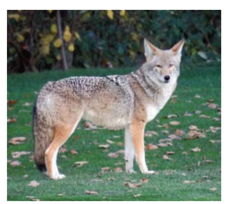
Wildlife and habitat management are an important part of Glendoveer's environmental efforts.

Glendoveer Golf & Tennis puts strong focus on the environment & sustainability