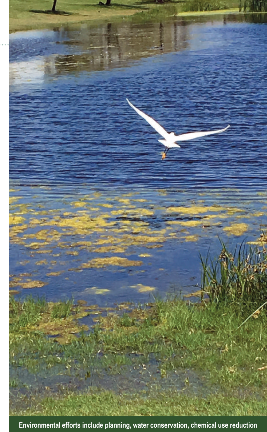
and safety, water quality management, and wildlife and habitat management.

Both courses have re-certified every three years since, which means they have upheld six key requirements - environmental planning, wildlife and habitat management, outreach and education, chemical use reduction and safety, water conservation, and water quality management.